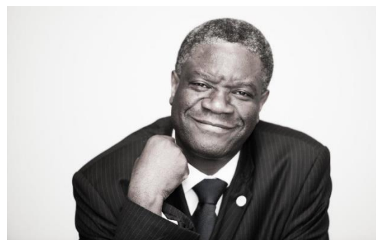
Dr. Denis Mukwege, Panzi Hospital, Kongo